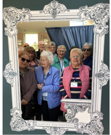
Local History Group's visit to the Portland Gallery