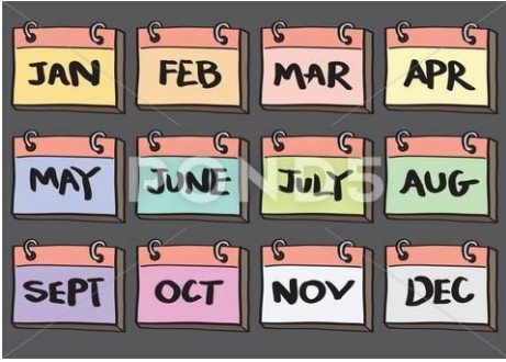
Armchair Film Club showing of the "Calendar Girls"