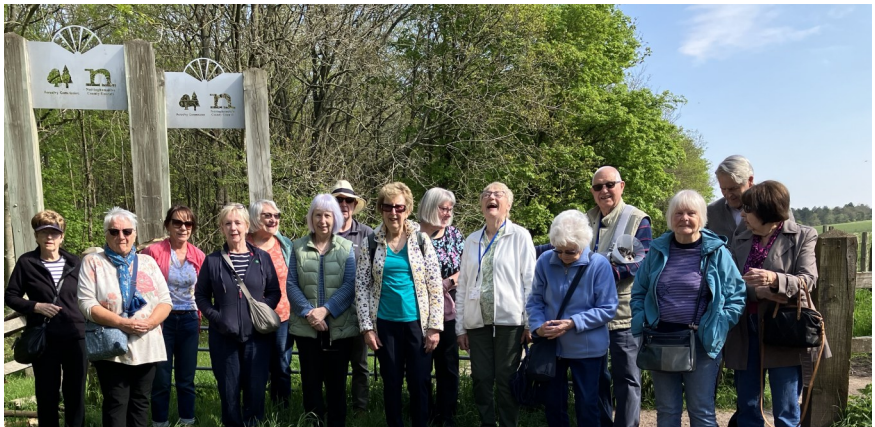
Strollers enjoying a morning along the "Yellow Brick Road" or Tippings Wood in Rainworth!